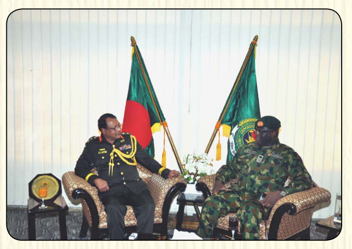
Delegation from Nigerian War College visited NDC and called on Commandant, NDC on 05 February 2017