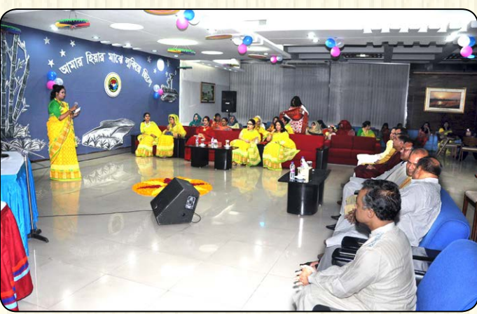
NDC Ladies Club organized "Spring Festival" to mark the colourful season of spring on 14 February 2017.